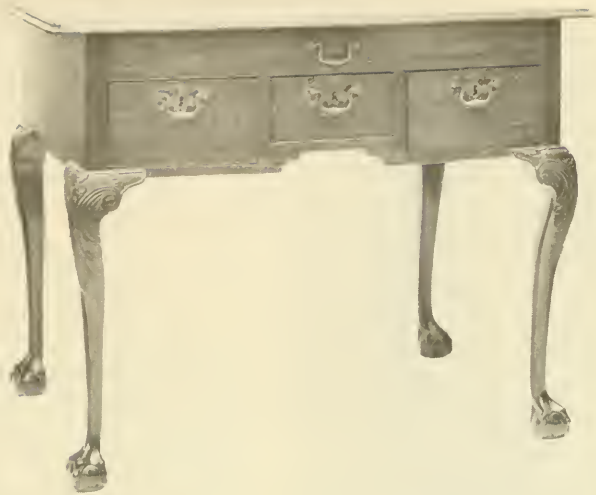
Figure 3a. Dressing table descending in a family of Bertie County, North Carolina. The shallow top drawer is fitted with compartments and originally had a ratcheted looking glass. The table is of mahogany with red oak drawer liners, yellow pine back and inner case. 29" HOA, 36½" WOA.