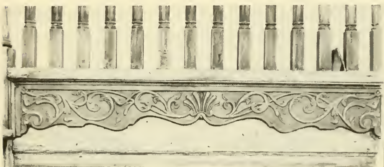
Figure 1a. Fascia board of poplar wood, cleaned of paint, from Blair-Pollock House, Edenton, North Carolina, c. 1766, now in the Museum of Early Southern Decorative Arts.

The stair brackets and fascia have shallow shell, vine and flower relief carving of distinctive design not readily associated with carving in other areas of the South (Figs. 1a & b). This is surprising when one notes the frequent movement of southern