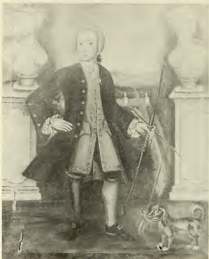
Figure 2. GEORGE BOOTH (dates unknown) Oil on canvas 50¼ x 39½ inches, actual size.