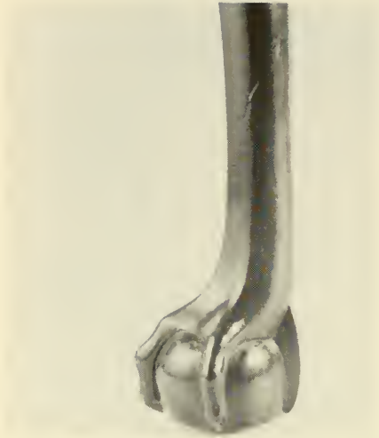
Figure 4. Foot detail, showing the unusual knife-like back talon in combination with knuckled front talons over an oval ball without connecting web, considered typical of the Albemarle region.