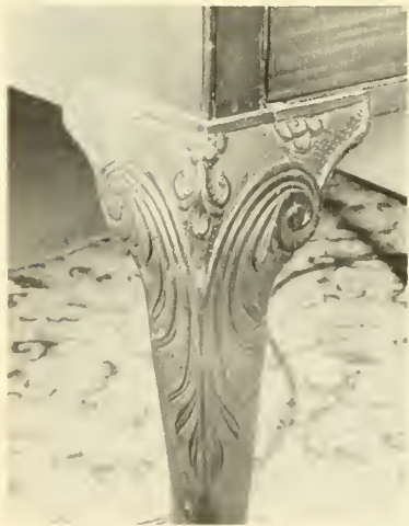
Figure 3b. Dressing table knee carving, attributed to the same hand as the stair-hall carving, figs. 1a and 1b.