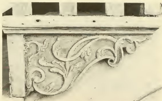
Figure 1b. Stair bracket of poplar, cleaned of paint, from Blair-Pollock House.