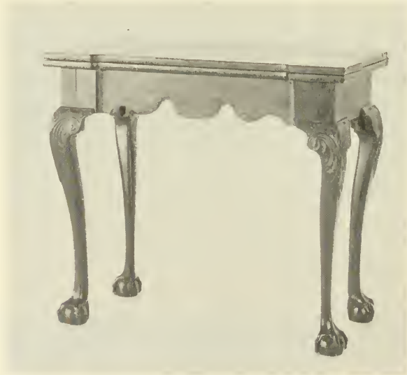
Figure 2. One of two identical gaming tables, one having descended in the Willie Jones family, "The Grove," Halifax, North Carolina. It is of mahogany with felt top fitted for counter pockets and candle reserves, and with secondary woods of red oak for frame and medial brace, American black walnut for gate frame. 27½" HOA, 31¾" WOA.

The tables (Figs. 2 & 3) have identically carved knees and brackets with similar strapwork running across the top and down the brackets to the leaf carving, and the same sparsely placed punchwork backgrounds. The back talons of the feet are unusually knife-like (Fig. 4). We attribute the carving to the same hand as the stair carving of the Blair-Pollock house.