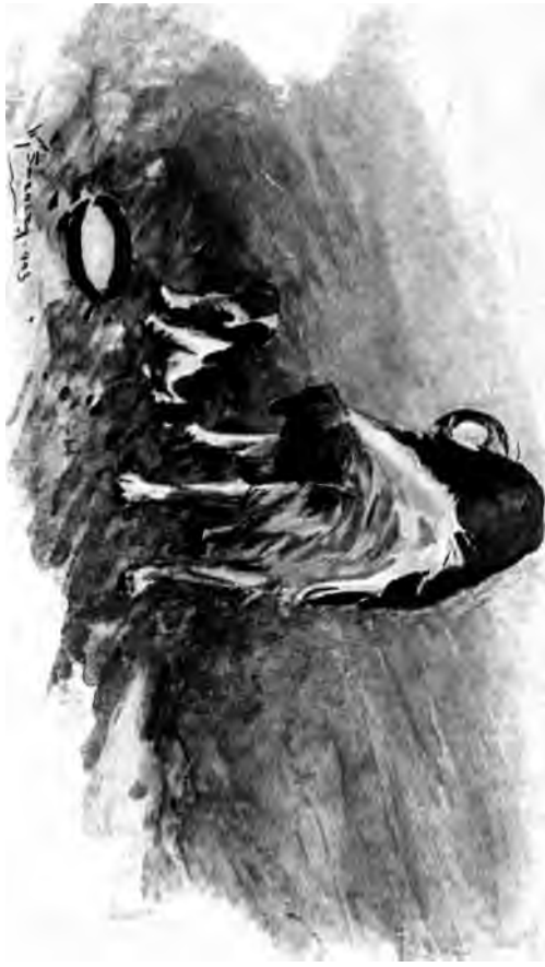
“BY-AND-BY CAME MY LITTLE PUPPY”