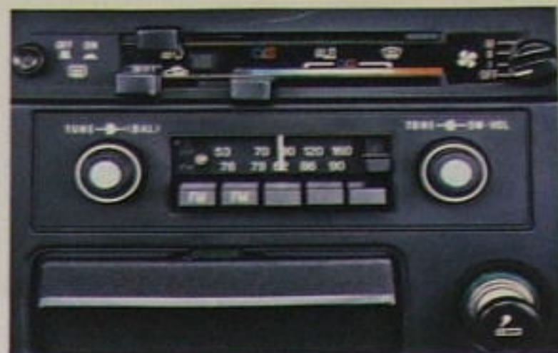
AM/FM stereo radio