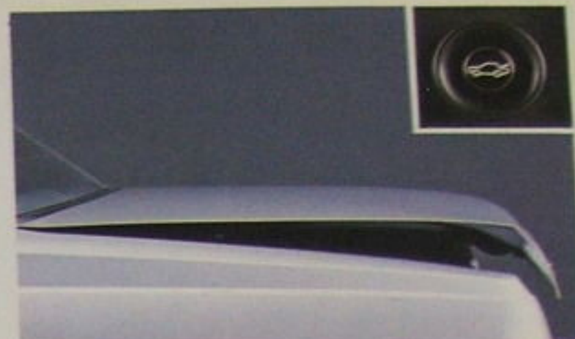
Remote controlled electric boot lid release