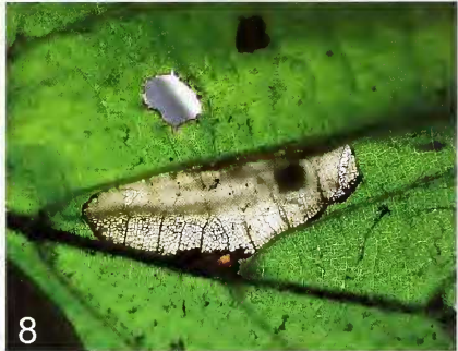
Figs. 1–8. Phyllonorycter issikii (Kumata, 1963) mines on Tilia cordata Zutendaal, (Belgium, Limburg), 29.x.2011, leg. Leaf miners group, (photos 1–4 S. Wullaert, photos 5–8 C. Snyers).