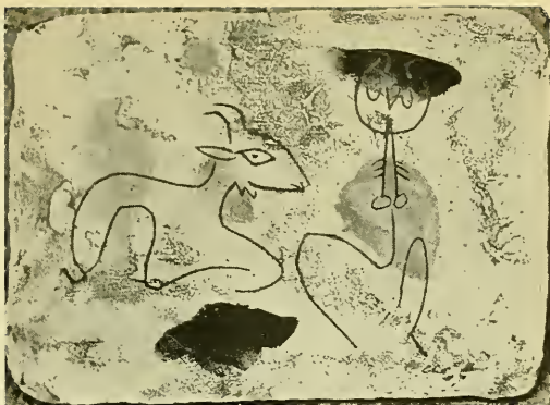
CATALOGUE NUMBER 1