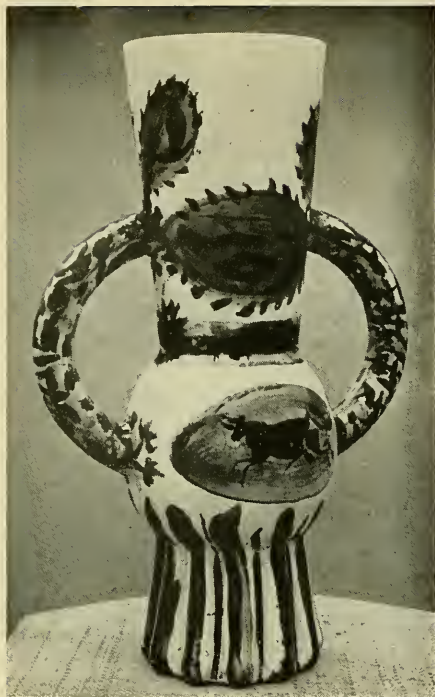
CATALOGUE NUMBER 8