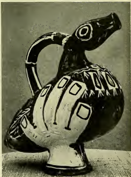
CATALOGUE NUMBER 28