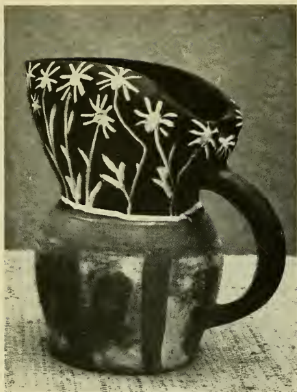
CATALOGUE NUMBER 17